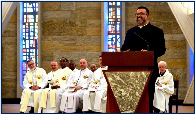
2006. Seven years later, he professed his first vows as a Dehonian.

He entered the ESL program at Sacred Heart Seminary and School of Theology in